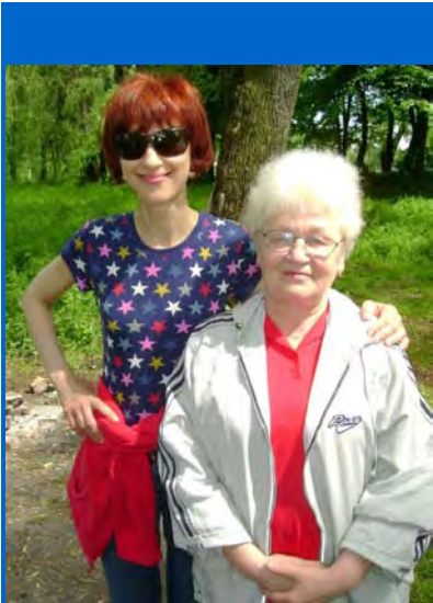
Congregational Picnic in Ivano-Frankivsk