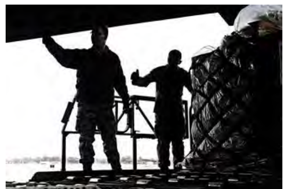
Airmen from the 375th Logistics Readiness Squadron give loadmasters the 'all clear' to move the final pallet onto a C-17 Globemaster III Feb. 7, 2011, at Scott Air Force Base, Ill.