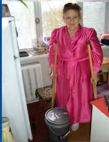
One of our family buckets was delivered to an invalid in a village of Ivano-Frankivsk