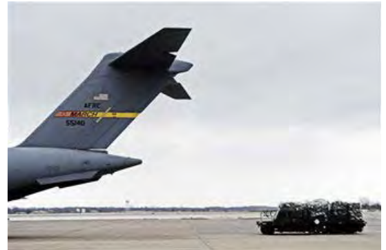
Officials in a cargo truck from the 375th Logistics Readiness Squadron pull up behind a C-17 Globemaster III to load humanitarian aid supplies Feb. 7, 2011, at Scott Air Force Base, Ill.

In 2008, more than 600,000 pounds of humanitarian goods were sent to 17 different countries through the Denton Program.