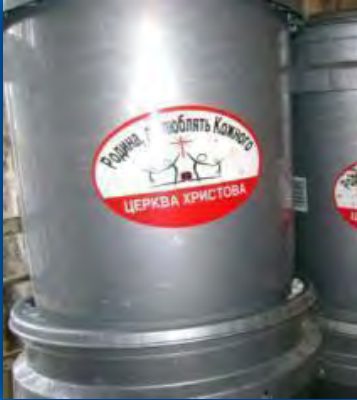
Label says: "Churches of Christ— Where everyone is loved"