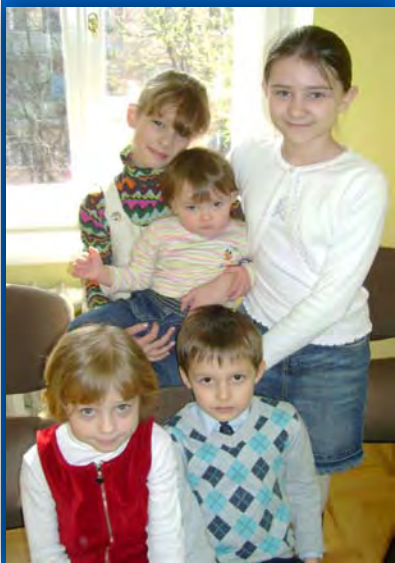
THE CHILDREN IN THE CONGREGATION

It has not been long enough since we became Christians – 17 years – and now we see our children pray and trust God. We thank God and those brothers and sisters from America, whose hearts are opened by God to come to Ukraine and preach the Gospel. We heard the Gospel thanks to them.