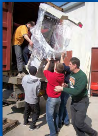
Unloading in Ivano- Frankivsk