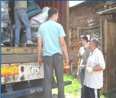
A container shipped into Slavyansk, Ukraine