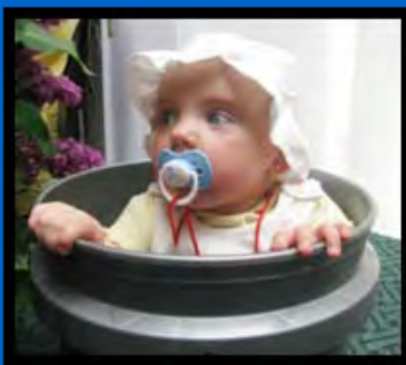
DISTRIBUTION IN ZHITOMYR, UKRAINE